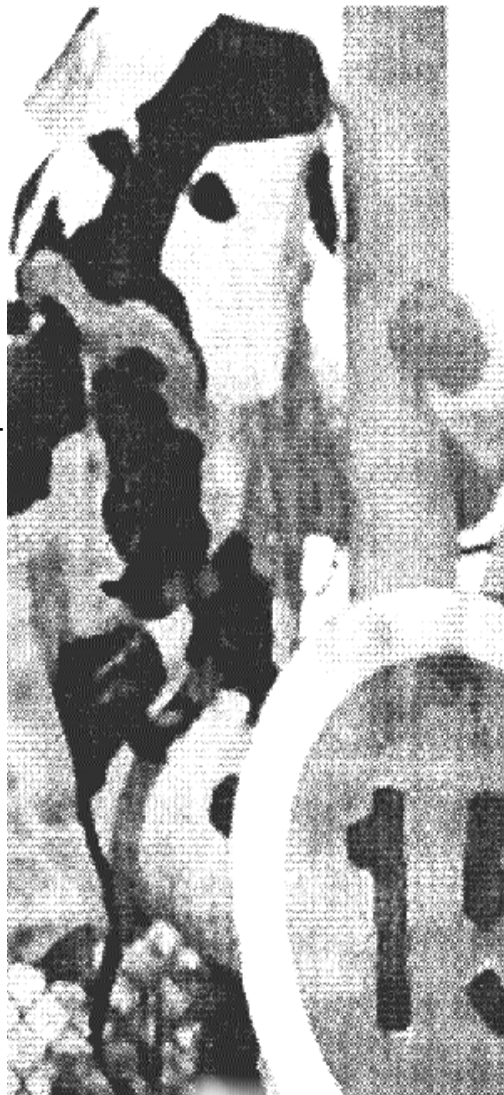
GM cow in lamppost scaling shocker

For more information on how to 'lock on' and blockade as safely as possible contact Dartmoor Earth First c/o PO Box 77, Totnes, Devon, TQ9 5ZJ. For everything you ever wanted to know about GM animal feed and the companies that make it, check out Corporate Watch's excellent briefings available at www.gm-info.org.uk , or by ringing 01865 791391.